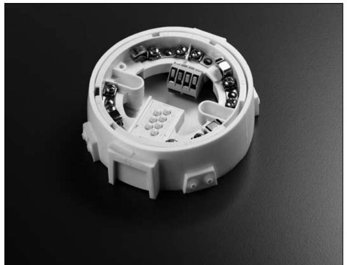
Part nos 45681-219 (Addressable — pictured above with waterproof base cover) ORB-HB-00020-APO (Orbis)

It is recommended that the heater base be used in conjunction with either a waterproof base cover, part number 45681-519, or a deckhead mounting box, part number 29600-196. The use of these accessories will reduce the risk of moisture ingress.